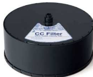
Fig.4 CC Filter

For these reasons, the DWR1722 employs the dead-end filtration, which enables downsizing. However, the filters currently available in the market are not practical because their lifespans are extremely short. Thus, we have developed "CC Filter" (Fig.4), an original filter dedicated to the filtration of drain water from the dicers. CC Filter is a disposable filter module having its own unique structure. With this filter, all the functions from (A) to (D) can be installed in the DI water recycling unit with a very small footprint.